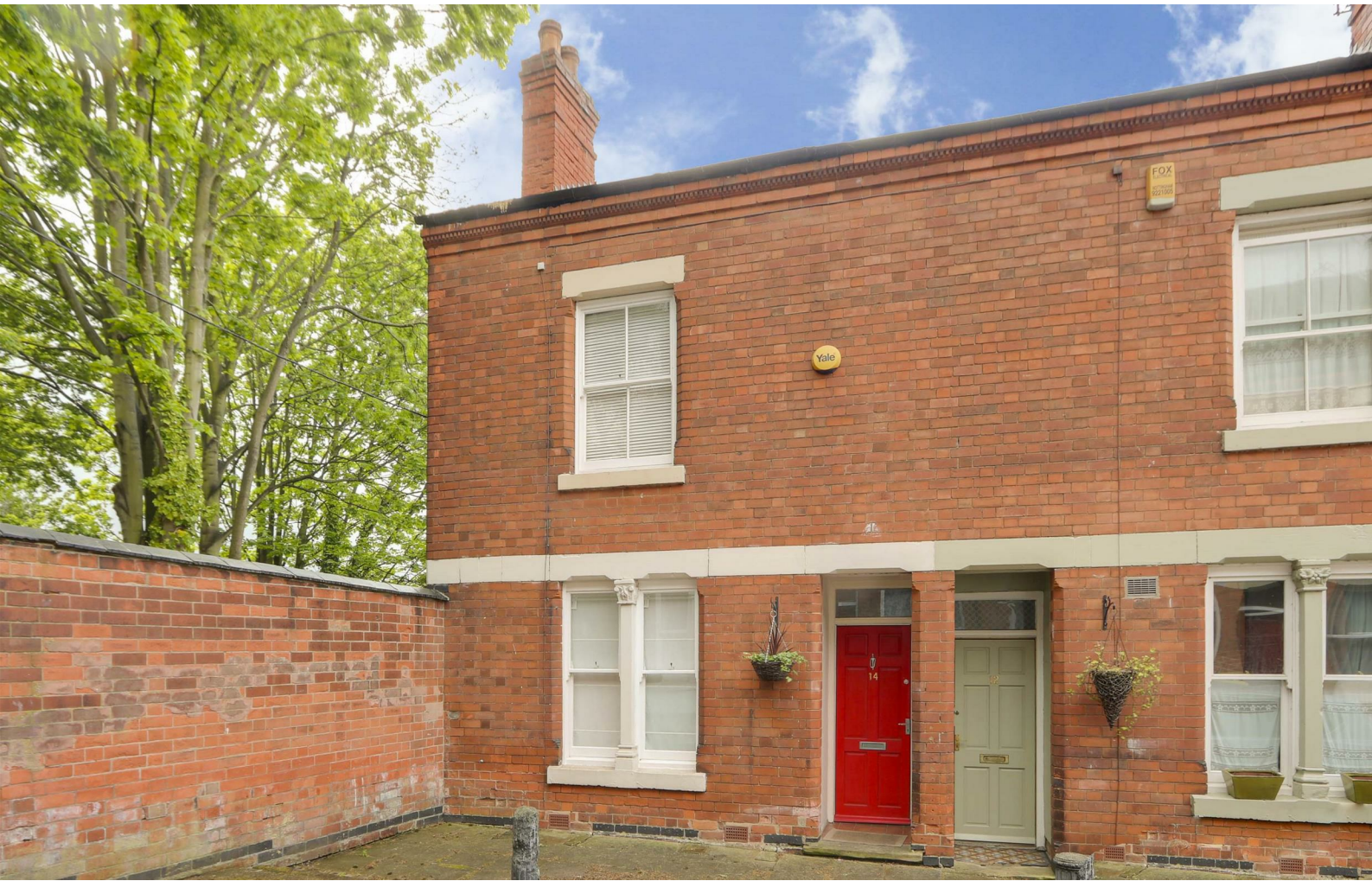
Perlethorpe Avenue, Sneinton, Nottinghamshire NG2 4JZ